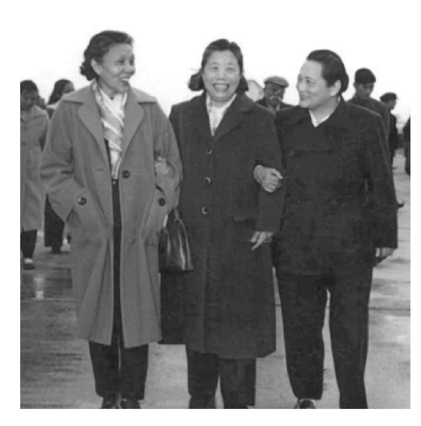
Cai Chang, Deng Yingchao, and Song Qingling, three prominent Chi nese leaders, attending the All-Asian Women's Congress in Beijing

In addition to advocating for the betterment of marriage laws for women and the enactment of feminist legal proceedings, this conference spoke volumes about the solidarity embedded within the Asian women's movement as a whole. While its host country, China (PRC), had established diplomatic relations with a mere ten countries at the time, this conference's continental attendance demonstrated "state feminists' conscious efforts to merge the women's movement in the PRC with socialist women's movements globally." 14