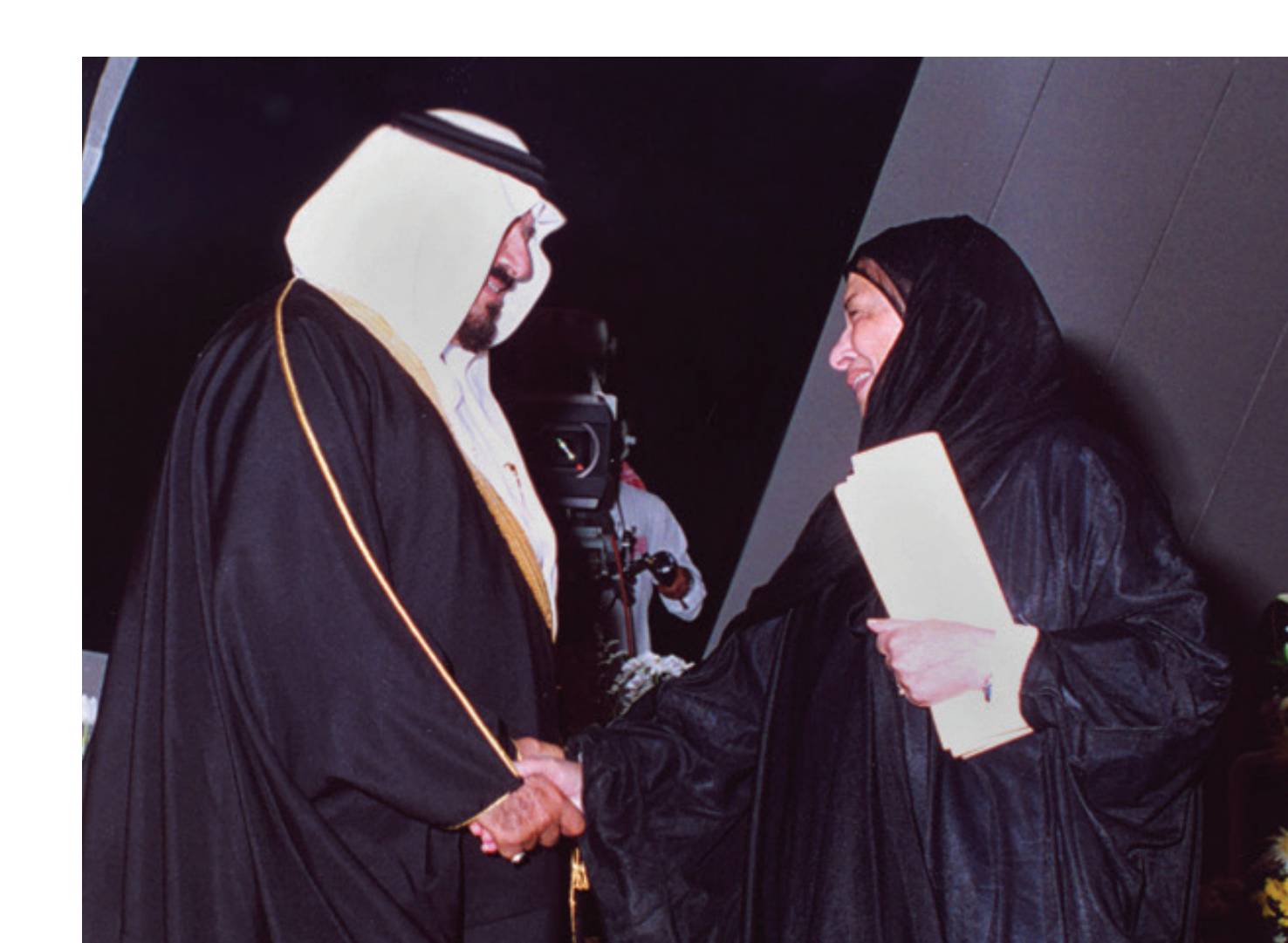
Aisha Abdul-Rahman receiving the King Faisal Prize for Arabic Language and Literature in 1994. <sup>20</sup>

Held in Cairo as a state-feminist conference, The Afro-Asian Women's Conference included leftist feminists linked to the Non-Aligned Movement (NAM) and was organized by the Afro-Asian Peoples' Solidarity Organization (AAPSO). <sup>21</sup> During the conference, women were present "not only in the hall, but also on the podium:" one of three plenary addresses came from Gandhian Rameshwari Nehru, a prominent Indian social worker, <sup>22</sup> and contributions from Aisha Abdul-Rahman.