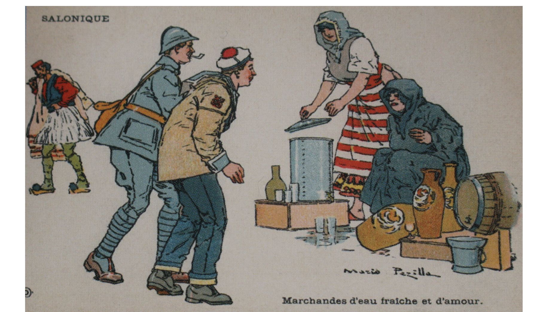
"Fresh water and love merchants"