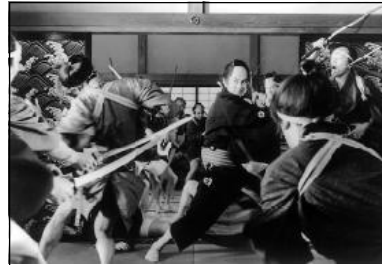
Koji Yakusho as Dora Heita