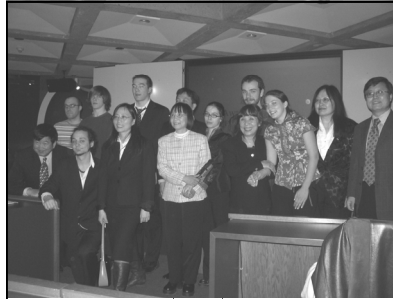
Chinese Speech Contest: Judges, Organizers and Winners

The 17 th annual Japanese Language Speech Contest was hosted on March 12, 2006, by the Centre d'études de l'Asie de l'Est at the Université de Montréal, with the support of the Consulate General of Japan at Montreal and the Japan Foundation. The event was a tremendous success with a wide variety of entertaining speeches by the contest's 33 participating students from McGill University, the Université de Montréal and UQAM. McGill was well represented and made a clean sweep of the prizes in the intermediate category. McGill students won the following prizes: