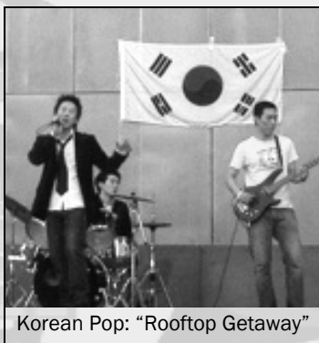
Korean Pop: "Rooftop Getaway"