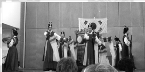
Po Go Lak Dance

from popular Korean pop songs to an electrifyingly rhythmic version of the Korean national anthem; especially well-