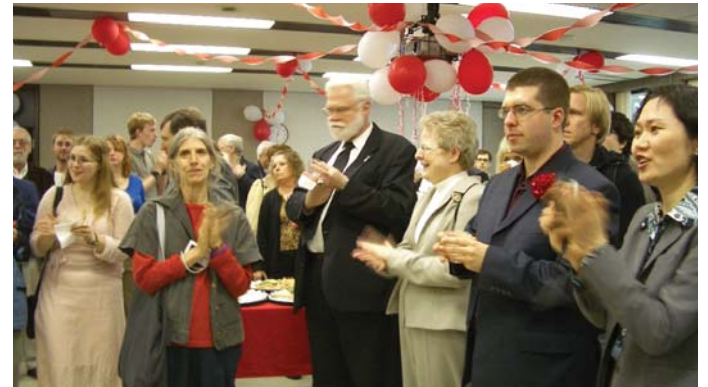
Applause for graduates at convocation celebration