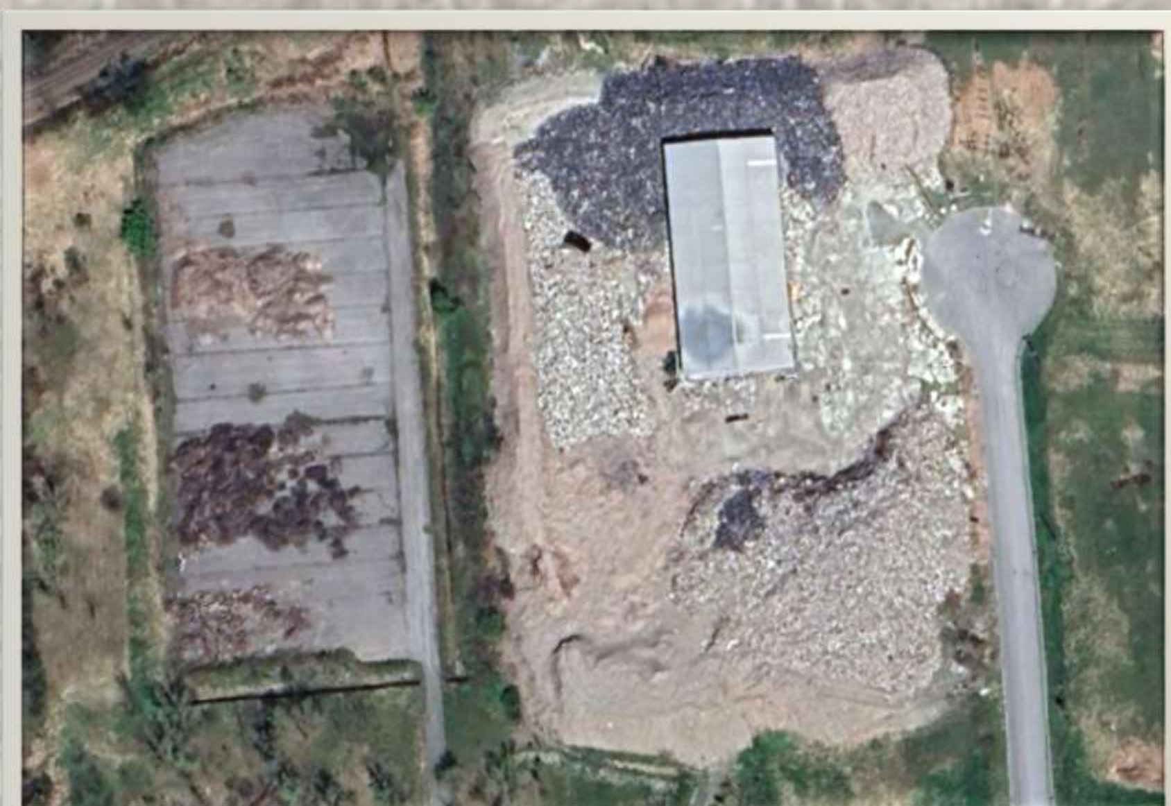
May 8 th 2023 - Satellite Imagery of the Property One Year After the Revocation of the Sorting Center's Permit