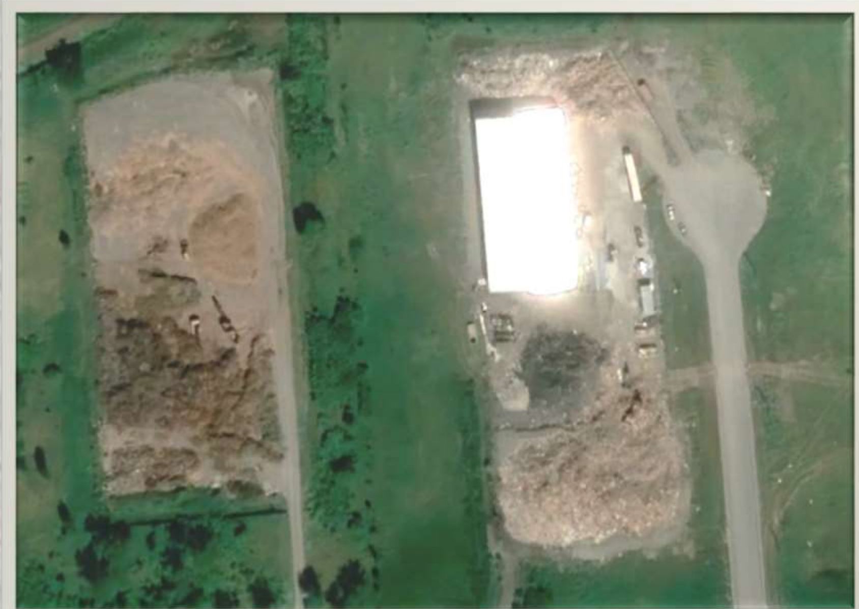
June 19 th 2020 - Satellite Imagery of the Property After the Opening of the Sorting Center, eighteen months after the first observed infraction