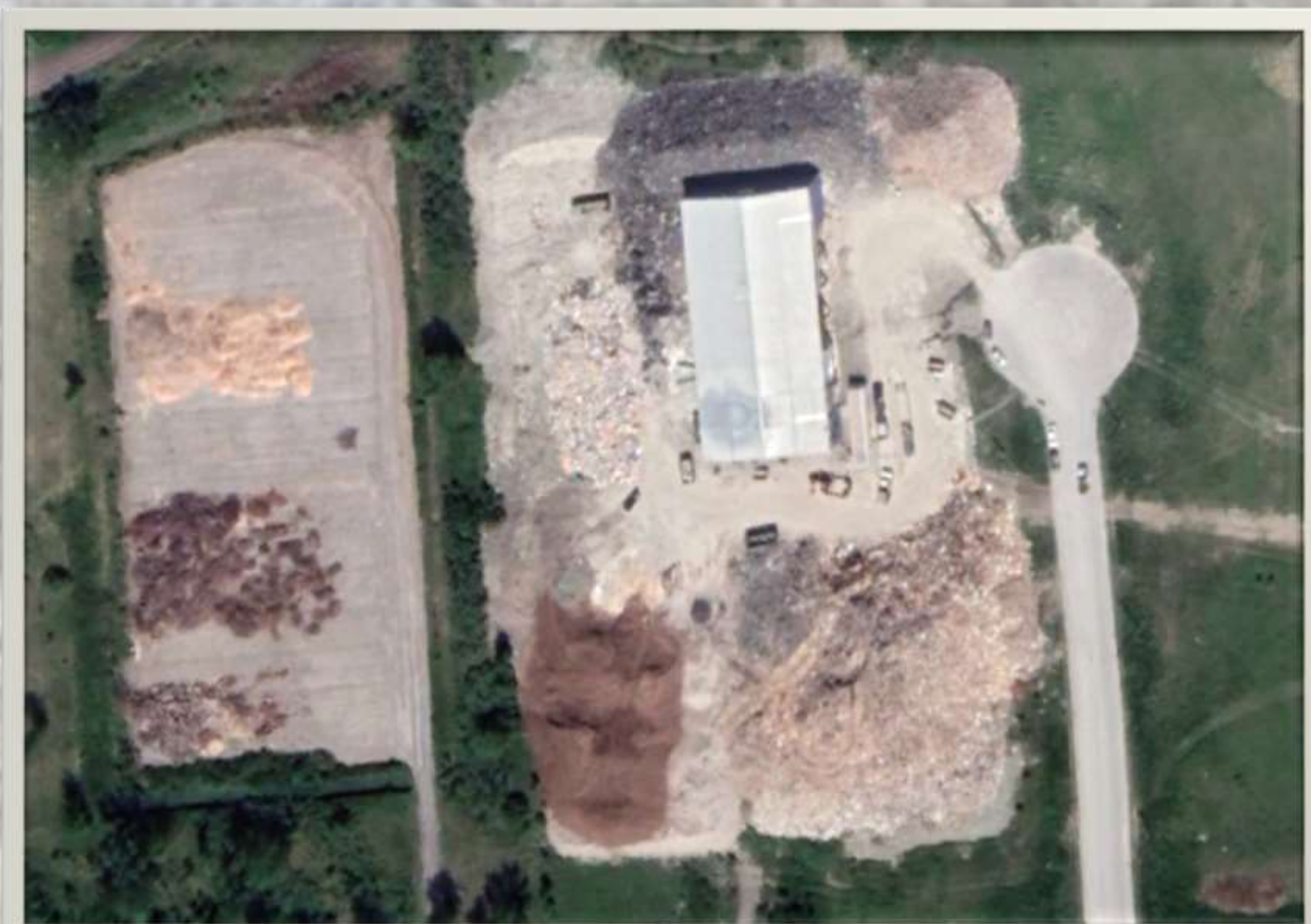
June 1 st 2021 - Satellite Imagery of the Property one Month Before the Provincial Regulatory Body's Ordinance