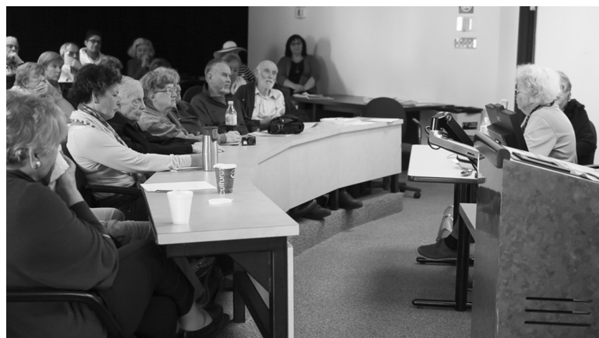
2016 Moderator's Workshops

Les frais de participation aux conférences, aux ateliers, et aux sorties sont de 8 $ et de 10 $, payable en argent comptant, le jour même.