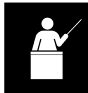
4) Seminar series