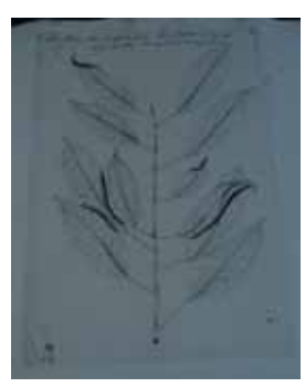
A medicinal root from an apothecary's drawer and an illustration of the Ficus Indica from the Jesuit botanist Georg Camelli, both from the Natural History Museum, London.