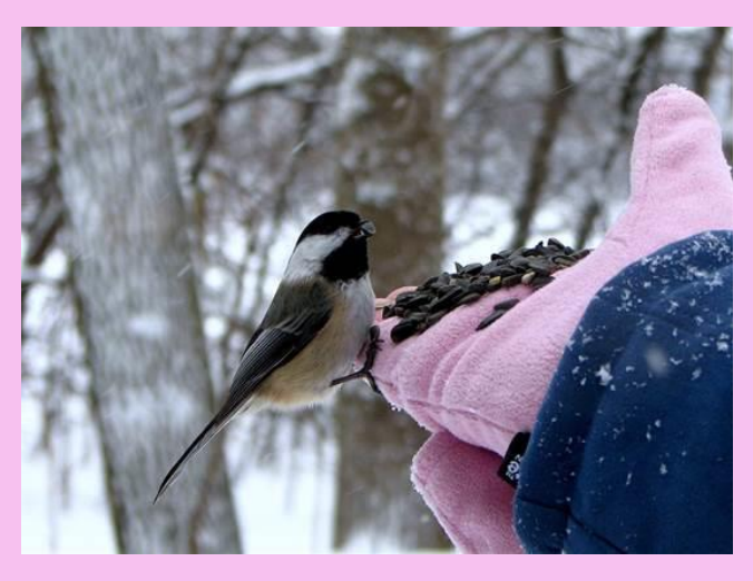
A chickadee feeds from a child's hand.

Tuesday, March 5: <u>Bird Feeding</u> for children over 3 years old