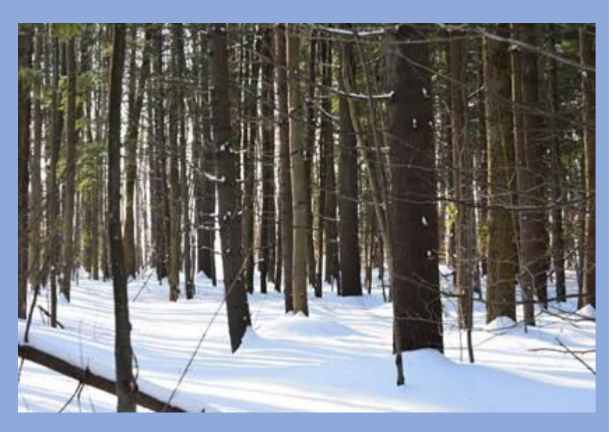
The chickadees songs were easy to hear in the peaceful forest.