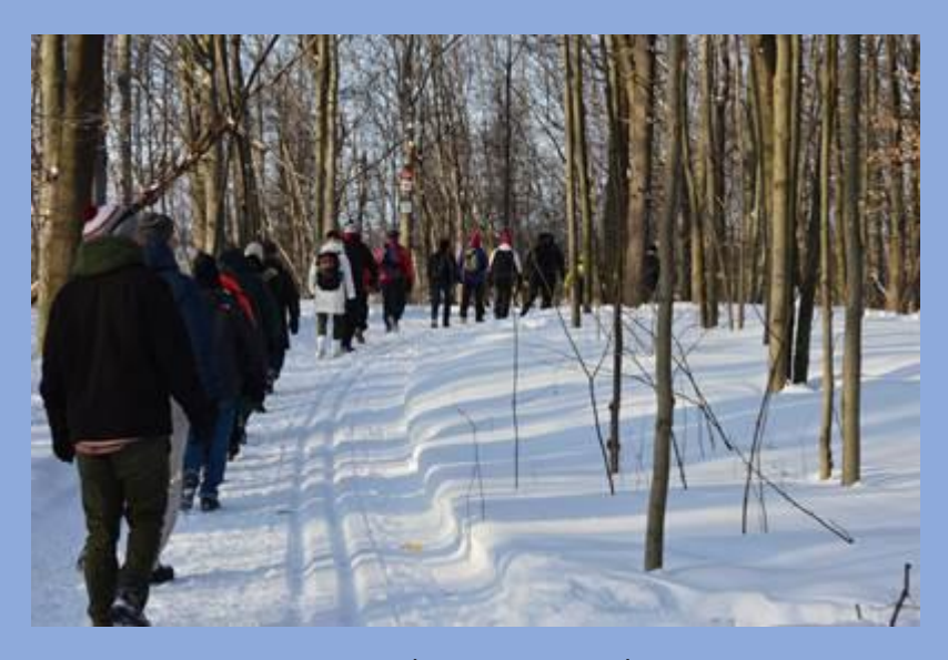
An early morning start!