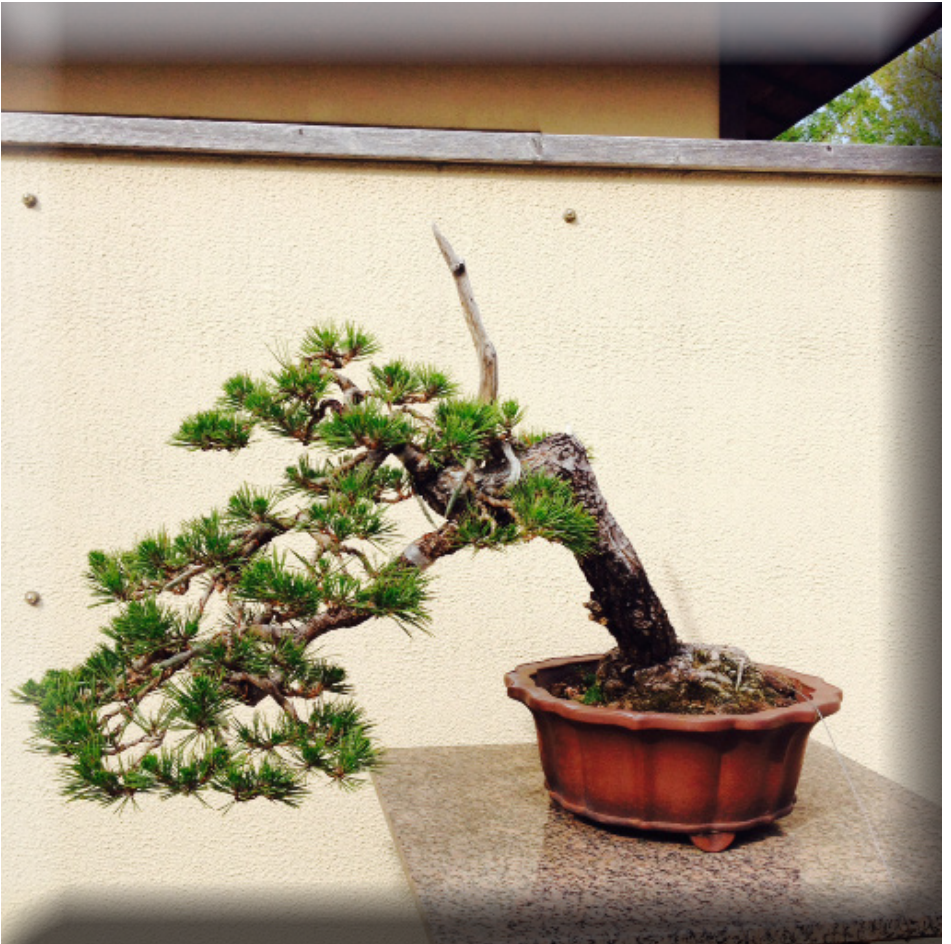
taken at the botanical gardens in Montreal