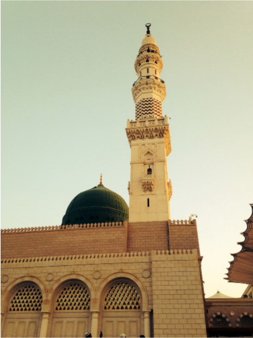
at prophet Muhammad's mosque in Madina, Saudi Arabia.