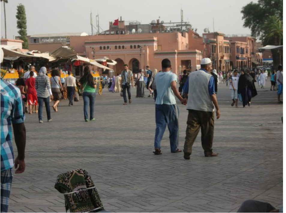
taken in Marrakesh, Morocco