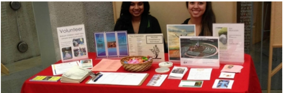
A view of one of MORSL's tables during clubs week at McGill University.