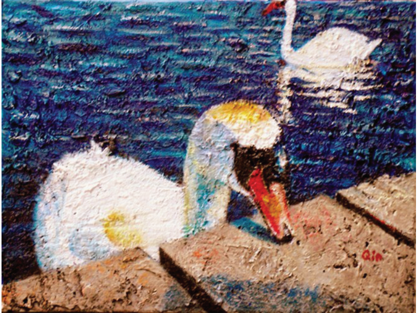
art by Charlotte Qin