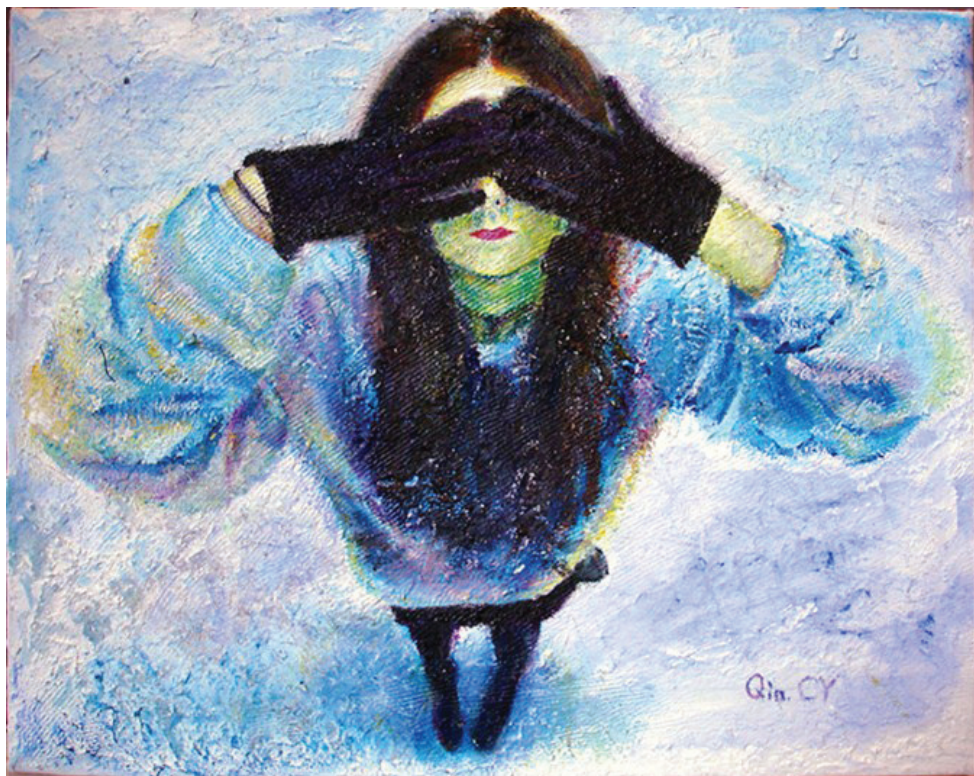
art by Charlotte Qin

The hierarchy of education in Egypt needs revolutionary steps. The youth were the leaders of the Egyptian revolution of January 25th 2011 and they are the hope of the future. The elected cabinet has to focus on developing primary, secondary and higher education. The number of graduates must correlate with labour market trends. Research is the key to improve the education system. Research must be integrated in each and every step. Freedom of thought and expression is a basic right for students.