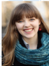
Elizabeth Hudler Center for Democratic Development Accra, Ghana