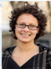
Geneviève Hill Women's Initiative for Self-Empowerment Accra, Ghana