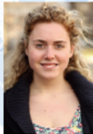
Molly Teitelbaum Benrimon Contemporary New York, USA