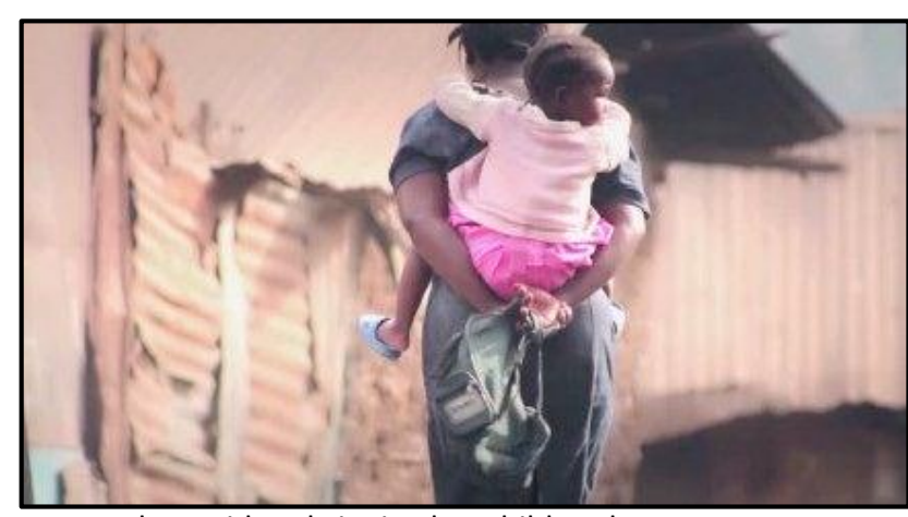
Korogocho resident bringing her child to daycare