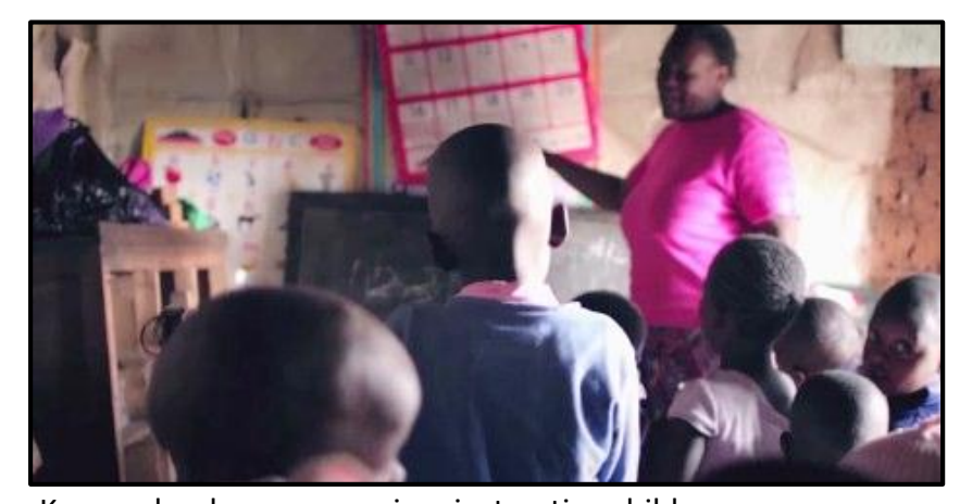
Korogocho daycare caregiver instructing children