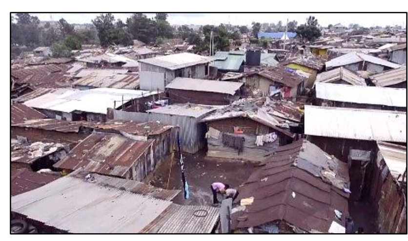
Korogocho slum neighbourhood located in northeast Nairobi

With results communicated through multiple publication and communication channels, this research will provide findings and recommendations to key policy actors in the areas of women's economic empowerment and childcare.