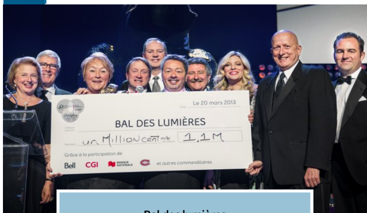
Bal des lumières