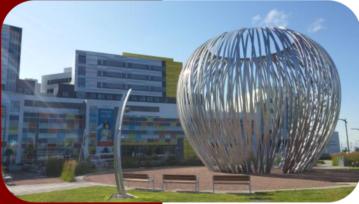
The Glen Yards Hospital

Another important aspect of our department's activities is in communicating our vision, our work and our successes to each other and to the public. For these reasons I am pleased to announce the forthcoming creation of a Department of Psychiatry Twitter account. I would welcome any feedback from you about ongoing activities and invite you to let us know about events you would like us to communicate.