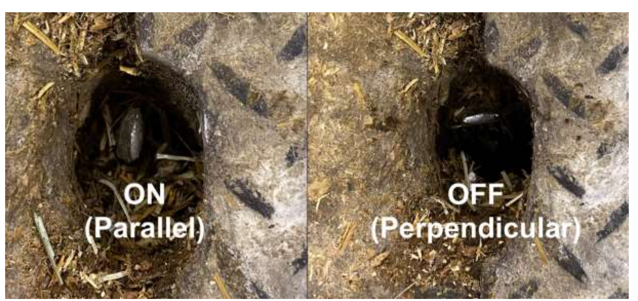
Figure 1: Gutter Valve Position