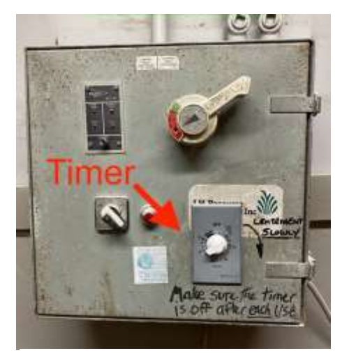
Figure 4 : Gutter Control (Pre-pit pump timer)