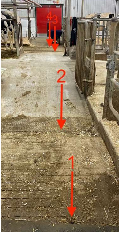
Figure 3: Gutter Valve Location