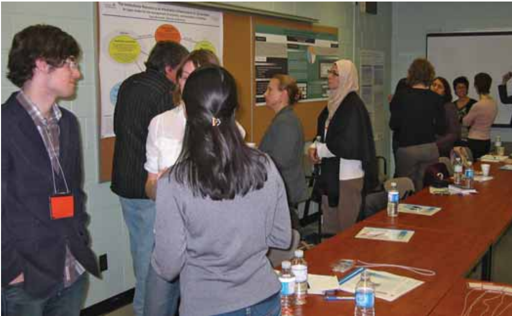
PhD students at the LIS Symposium.

So close, yet so far. Most of us travel long and far to attend academic conferences, hoping to meet people working in our field of study, but we often barely know those working in our own backyards. On March 23, 2007, the SIS PhD students were proud to welcome PhD students from the University of Montreal EBSI program to the first Montreal LIS PhD symposium. The group of more than 20 doctoral students spent the entire day together and enjoyed 10 oral presentations, five research posters, lunch provided by SIS, and a final cocktail at Thomson House. This impressive 90 per cent participation rate and comments from attendees suggest the activity was worthwhile and will be repeated in the future.