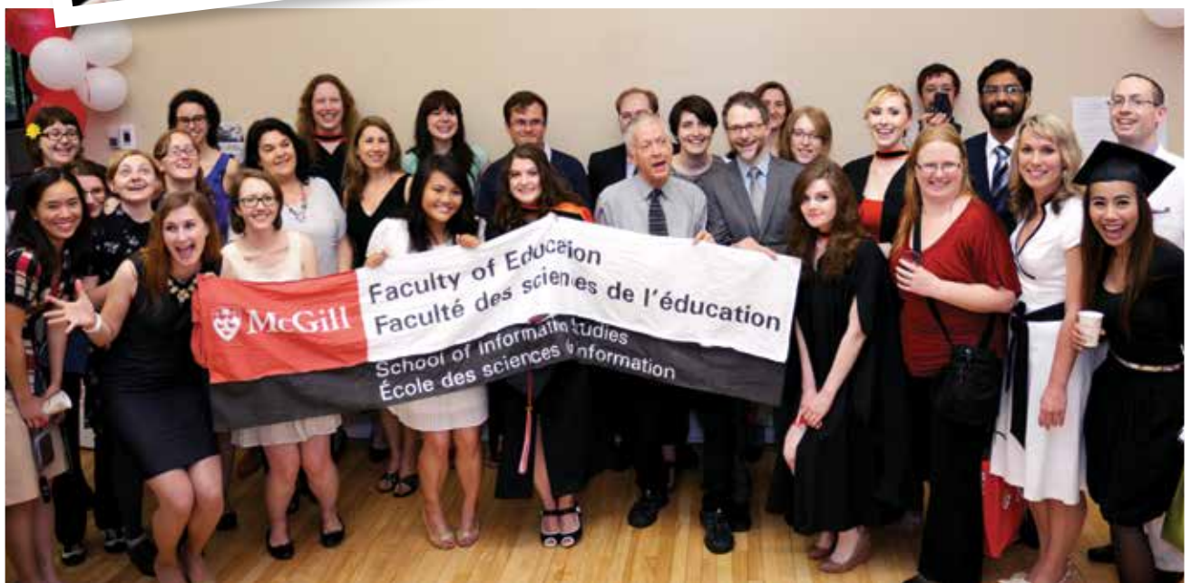
Convocation 2013.